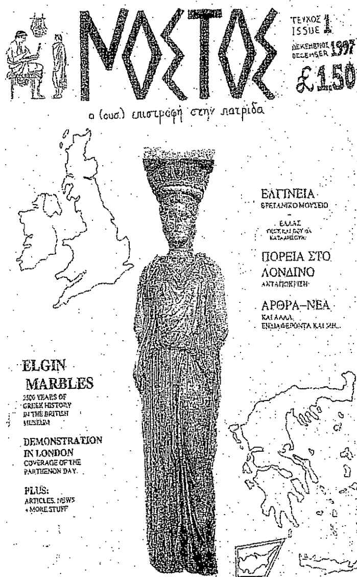
Plate 4 The cover of the first issue of the student magazine Nostos , produced by the Hellenic Society of the University of Wales Lampeter. The explanatory note on the title reads: 'return to the homeland'.

cannot possibly be the proper custodians of what is seen as one of the most valuable pieces of global (Western) heritage.