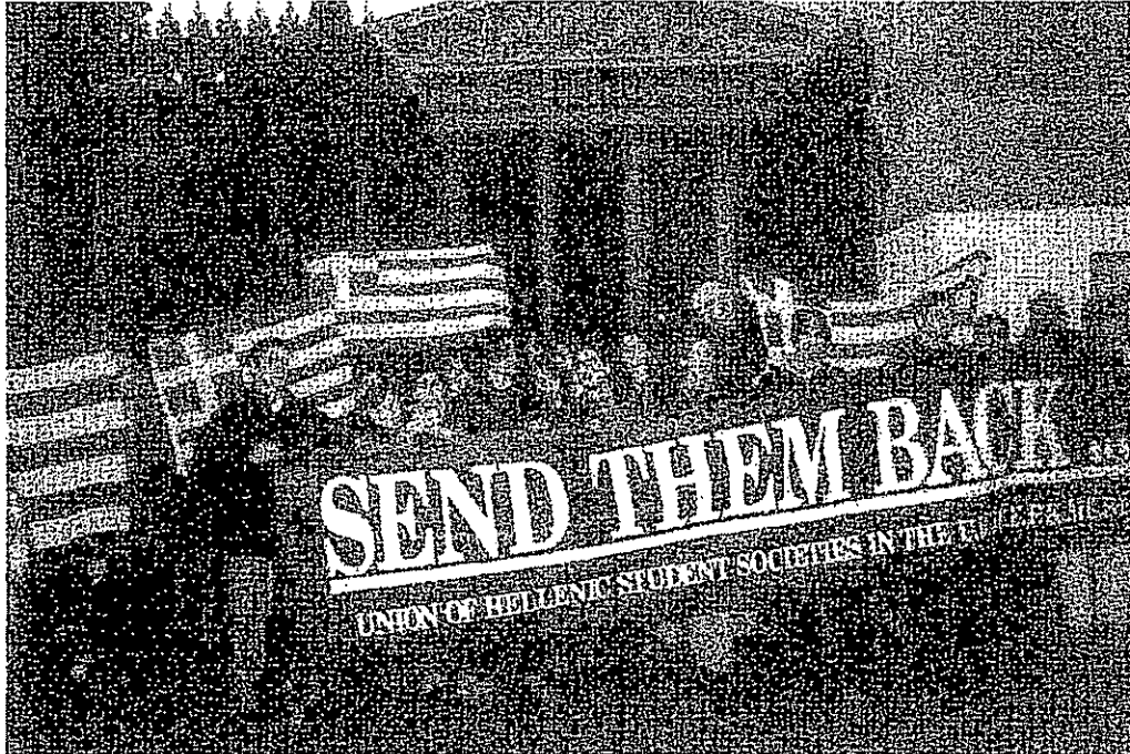
Plate 1 From the student demonstration for the restitution of the Parthenon marbles (British Museum, 5 December 1997).

sculptures are in London and the other half in Athens, either on the monument itself or in the Acropolis Museum. More specifically, the British Museum holds half of the original frieze (c. 75m in length), fifteen metopes and seventeen pedimental fragments. In the original collection are also included a caryatid and a column from the Erechtheion. A small number of fragments from the Parthenon sculptures can also be found in a number of other museums such as the Louvre and museums in Denmark, Germany, Austria and Italy (Greenfield 1996), although there are no calls for their restitution.